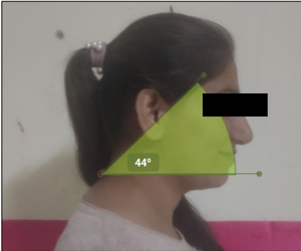
Figure 1. Measuring CVA by Kinovea software